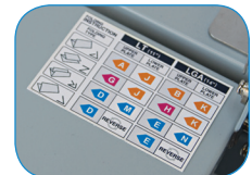
Clearly marked fold guide for quick and easy setup